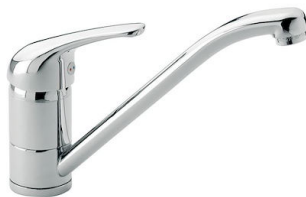
Mixer Tap S1000 - RO 8443 002