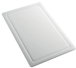
HPDE Chopping board 8657 001