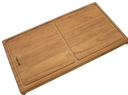
Iroko-wood sliding chopping board 8643 000